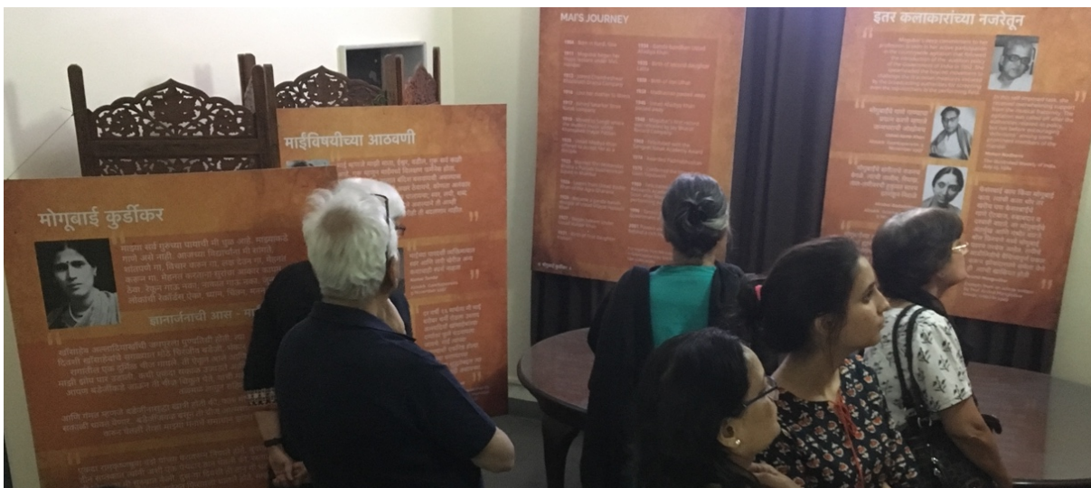
Visitors reading about Vid. Mogubai Kurdikar's life and musical journey

the archive. Other dignitaries present during the inauguration were Vid. Padma Talwalkar and Pt. Raghunandan Panshikar who both spoke about their experiences with Mai. During the inauguration, we also had an exhibit that gave the audience a chance to read about various aspects of Mai's life. Recognising that most in today's generation would not have had a chance to see Mogubai ji in person, or may not have even heard much about her, we created a visual exhibit to allow readers to learn more about her. The exhibits consisted of a timeline of Mai's musical journey, quotes on her gayaki by eminent musicians such as Ustad Amir Khan and Vidushi Hirabai Badodekar, and some memories from her disciples.